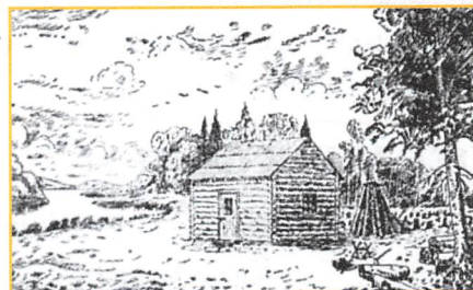
Figure 33 A French colonist’s dwelling